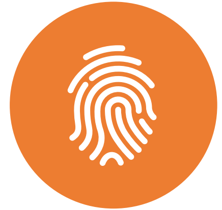
The ARTCLEAR scanner detects microscopic differences